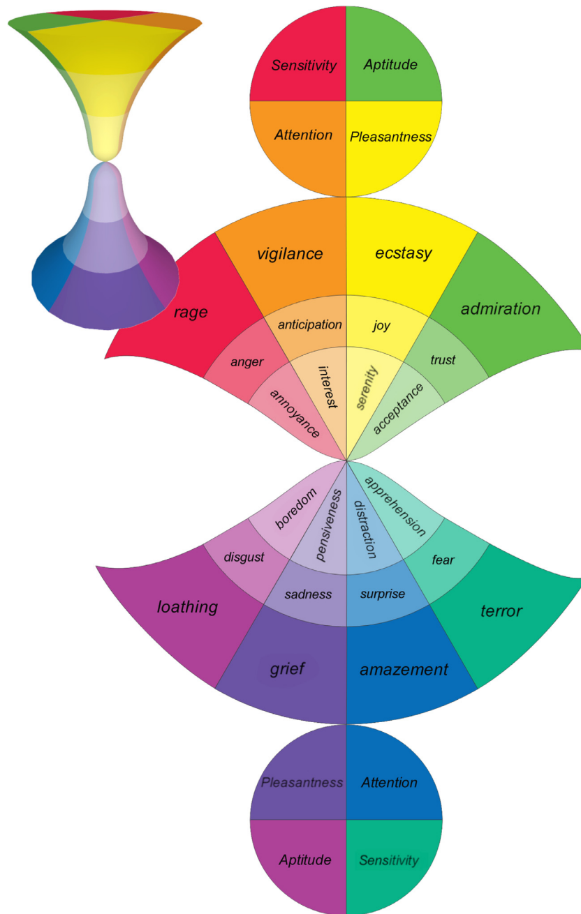
Fig. 1. The hourglass of emotion.

product reviews [33], news [34], tweets [35], and essays [36], to name a few.